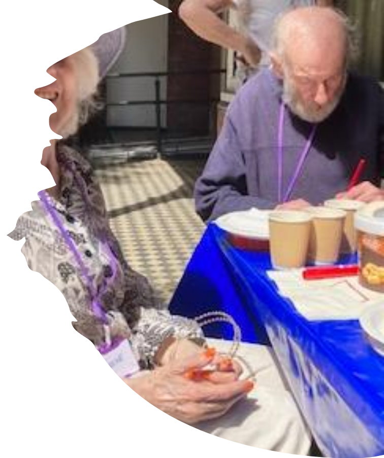
St Vincent's Brighton (Tower House) - Reaching those on the periphery: